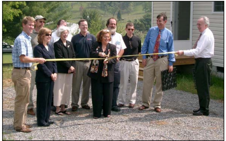
Members of MSI's Board of Directors and representatives of our partners Federation of Appalachian Housing Enterprises, Inc. (FAHE), Virginia Housing Development Authority (VHDA) and Virginia Department of Housing and Community Development (DHCD) at the Deerfield open house and ribbon cutting ceremony in June 2006.